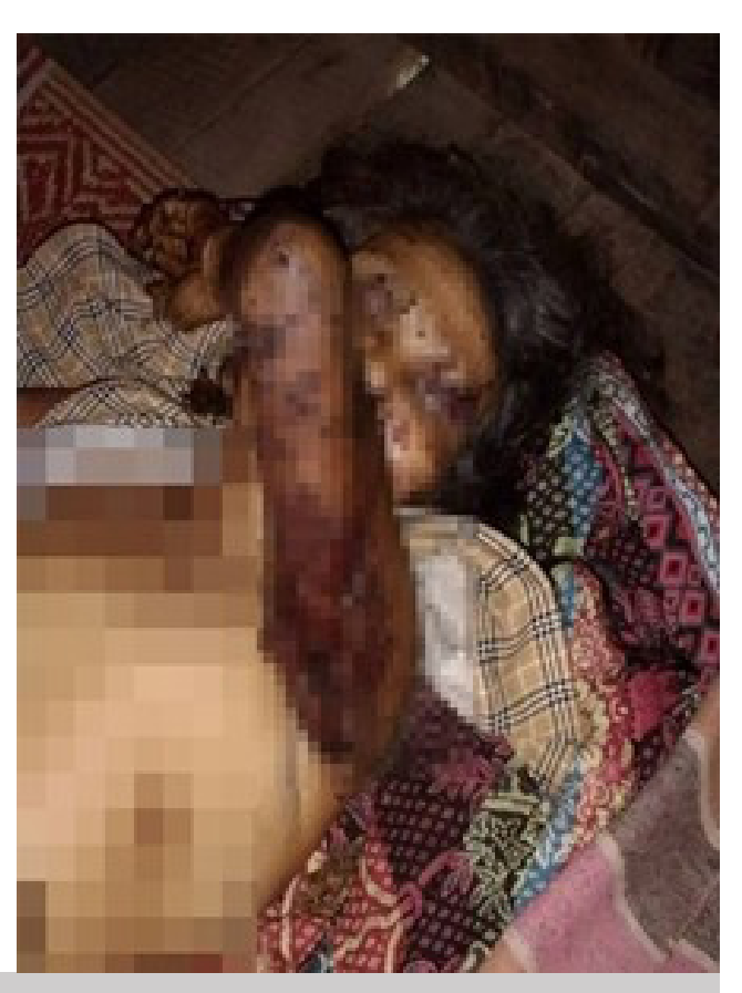
These photos were taken on January 13th 2023 in H--- village, Than Moe Taung village tract, Daw Hpa Hkoh Township, Taw Oo District. They show the body of Daw I---, a 68-year-old female villager after she stepped on a landmine on January 13th 2023 near H--- village. The landmine was planted by SAC troops following armed clashes in the area.