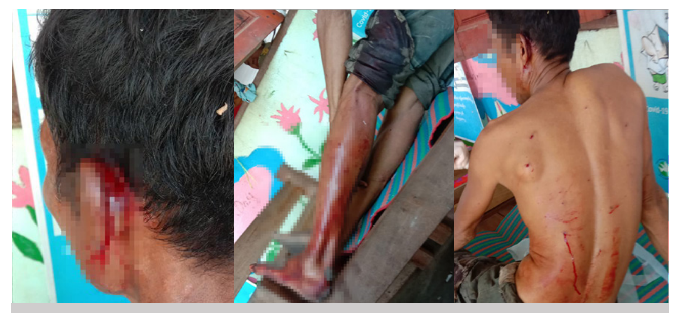
The photos were taken on October 20th 2022 and show the injuries a villager, M---, sustained from a tripwire landmine explosion in N--- village, Maung Khee village tract, Kaw T'Ree Township, Dooplaya District, on the same day. The photos show the injuries to his left ear, left leg, and on his back.

of landmine contamination across the state, rarely signposted, IDPs are at risk of landmine explosions when seeking safety in new areas. For instance, in early 2021, villagers from Xx---village, Meh Way village tract, Dwe Lo Township, Mu Traw District, had to flee fighting in their area and were displaced to a place in Bilin Township. As Ashin<sup>31</sup> Xc---, a monk from Xx--- village, explained, these villagers were deeply afraid of the landmine contamination in the area they fled to, as they had no way of knowing where the landmines were. Moreover, as landmines are often left behind after fighting, Ashin Xc--- explained that IDPs were also afraid to return home to their villages because of new landmine contamination.<sup>32</sup>